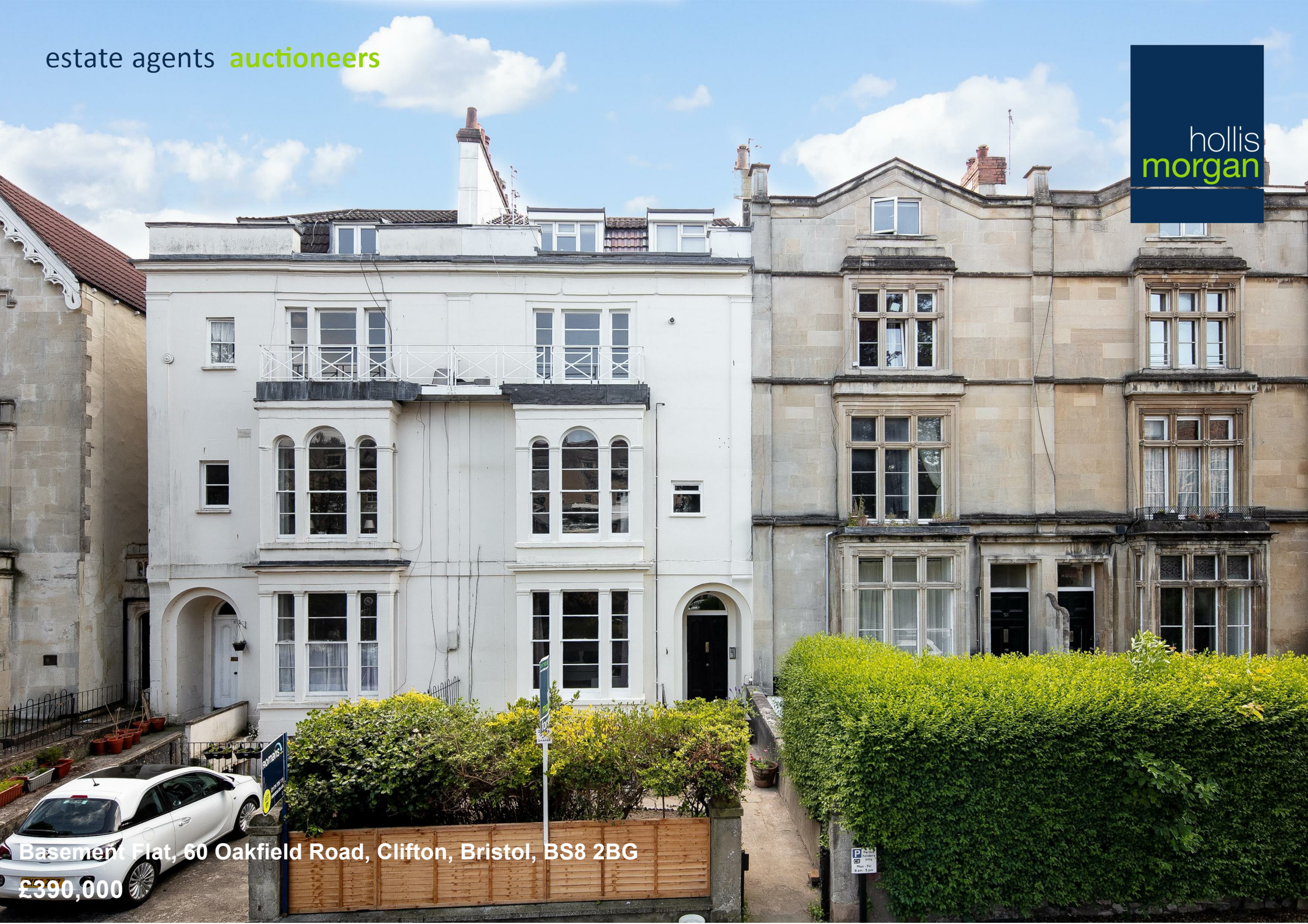
Basement Flat, 60 Oakfield Road, Clifton, Bristol, BS8 2BG